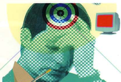
多学科的认知科学研究