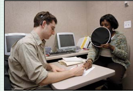
Cochlear Speech Training