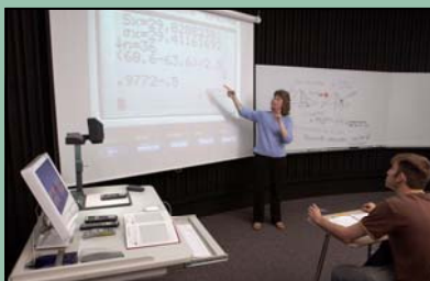
High technology classroom

During 2005, five focus groups were conducted at NTID, involving instructional technology specialists, technology and deafness specialists, corporate partners, and deaf students. The groups identified four strands of work where there exists a need and opportunity to improve access technology. Accordingly, the Center will focus its efforts on the following strands of work: