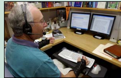
Voice Recognition Technology

The Center is focusing its efforts on technologies that have a high likelihood of improving access to postsecondary educational opportunities for deaf students within the next several years. The time frame for the Center's projects—from launch to completion—will be 18-36 months. Upon project completion, the Center will report and disseminate project findings, developments, and any resulting instruction and training issues to appropriate organizations and individuals.