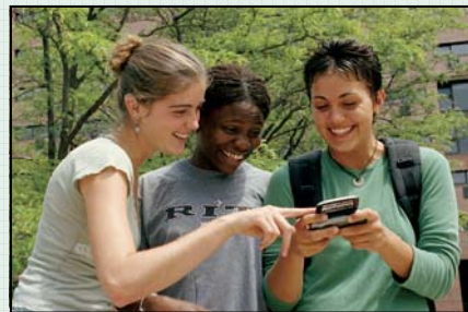
Students Using a Sidekick

To address the unique challenges of utilizing or adapting new technologies for use in postsecondary educational settings is needed, Rochester Institute of Technology (RIT) through its National Technical Institute for the Deaf (NTID) established the Center on Access Technology for Students who are Deaf or Hard of Hearing .